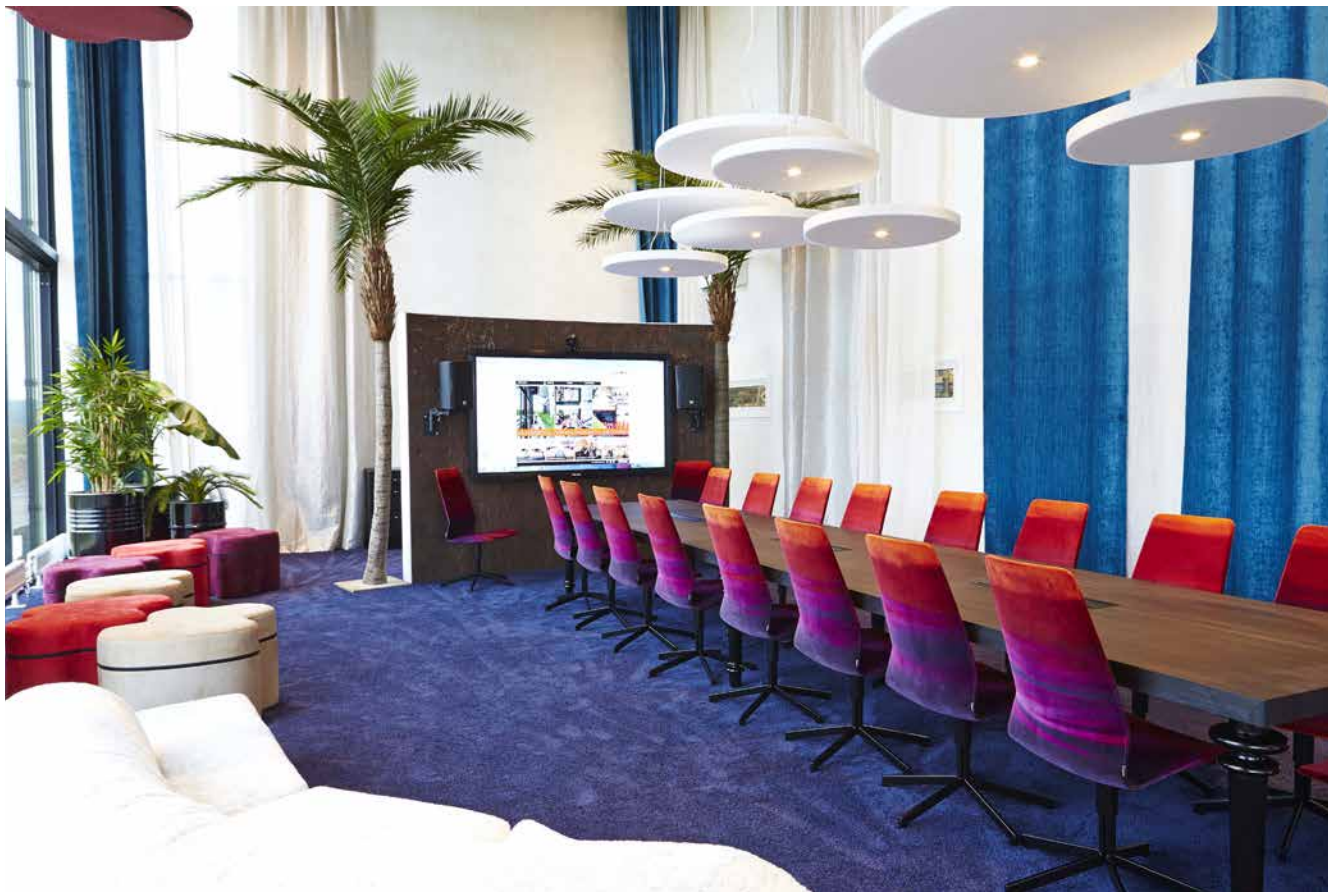
The huge conference room, with 3.5 m tall palm trees in the conference room can even be seen from the motorway. The thought comes to mind that both concisely listed agendas and discipline are required from meeting participants to prevent their attention being caught up in the panoramic view.

Gotessons sees a clear trend that, in combination with the increasing rental rates in the big cities & prime locations, the office space is getting smaller and more compact because companies see it as unnecessary to pay for more space than required. More staff in less space means open offices, smaller office desks and small storage facilities with poor acoustics, which increases the need for smart products and solutions for better storage and acoustics.